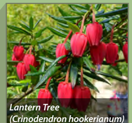
Lantern Tree ( Crinodendron hookerianum )