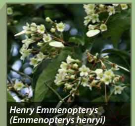
Henry Emmenopterys ( Emmenopterys henryi )