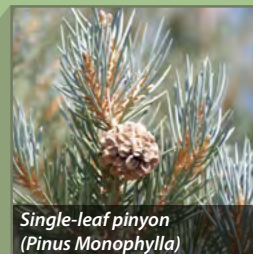
Single-leaf pinyon ( Pinus Monophylla )