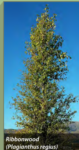
Ribbonwood ( Plagianthus regius )