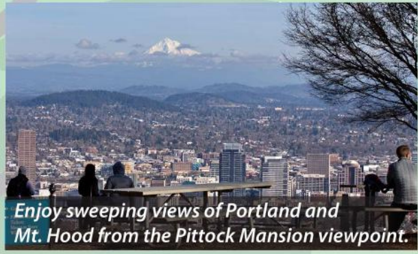
Enjoy sweeping views of Portland and Mt. Hood from the Pittock Mansion viewpoint.